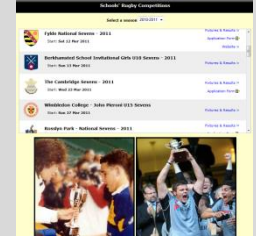
Figure 2 - Competition Calendar