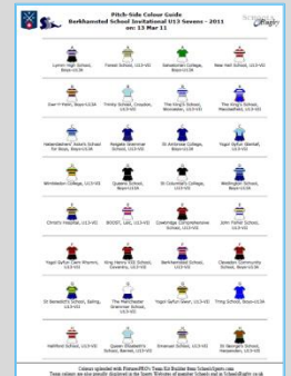
Figure 4 - Pitch-Side Colour Guide